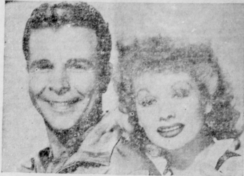
Dick Powell and Lucille Ball in a scene from "Meet The People," with Spike Jones and his band.