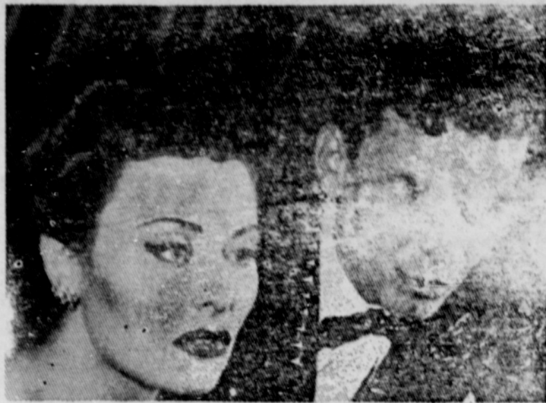
Michele Morgan and Frank Sinatra are co-starred with Jack Haley in the newest and greatest musical, "Higher And Higher," with Leon Errol.