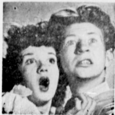
Donald O'Connor and Peggy Ryan in "Top Man."

APPEARING AT THE LITHEA Sunday - Monday - Tuesday