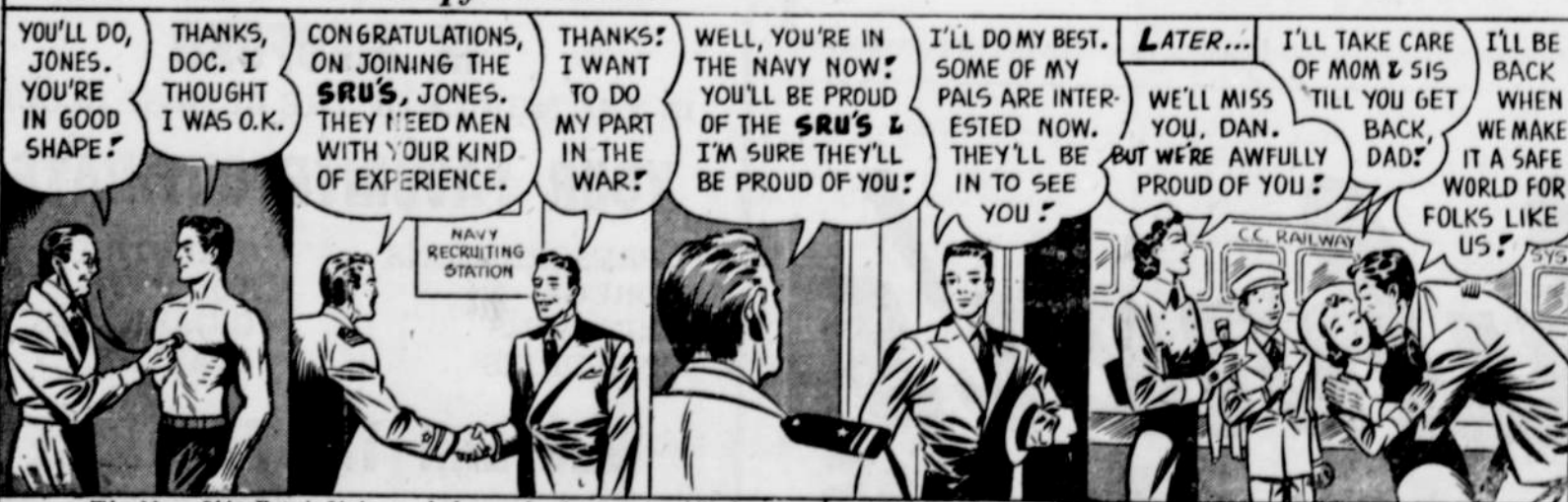
The Navy Ship Repair Units need thousands of patriotic, skilled craftsmen to fix our fighting ships. Men are accepted only in non-restricted manpower areas. Good mechanics may qualify as petty officers. The Navy Recruiting Station has complete information. Call, write or telephone.