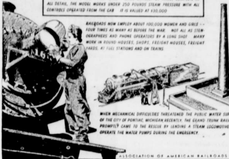
RAILROADS NOW EMPLOY ABOUT 100,000 WOMEN AND GIRLS—FOUR TIMES AS MANY AS BEFORE THE WAR. NOT ALL AS STEAM OPERATORS AND PHONE OPERATORS BY A LONG SHOT! MANY WORK IN ROUND HOUSES, SHOPS, FREIGHT HOUSES, FREIGHT YARDS, AT FULL STATIONS AND ON TRAINS.