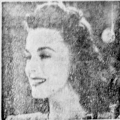
MARGUERITE CHAPMAN in "DESTROYER"