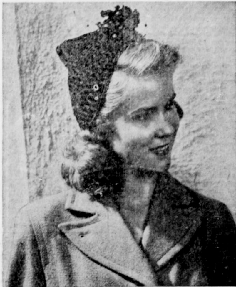
Here's a perky hat for those of you who are handy with a crochet hook. Smart and youthful, it is "right" for all occasions. You might make it in a soft, deep color, topped with glossy beads for a festive appearance. Or crochet it in several other combinations as gifts for your friends. Directions for making the hat may be obtained by sending a stamped, self-addressed envelope to the Needlework Department of this paper, specifying design PC-1534.