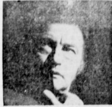
Claude Rains in "Phantom of the Opera"