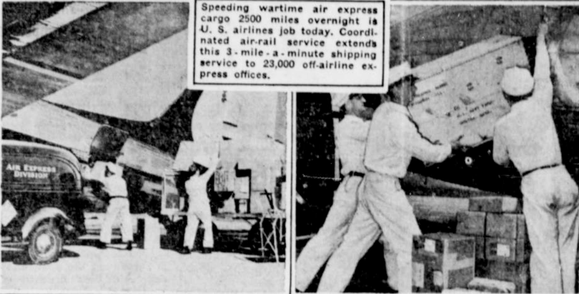
Speeding wartime air express cargo 2500 miles overnight in U. S. airlines job today. Coordinated air-rail service extends this 3-mile-a-minute shipping service to 23,000 off-airline express offices.

COMMERCIAL air express is starting its 17th year of operation in the United States. It was on September 1, 1927, that the first regularly-scheduled air express service was begun. At some 26 cities from coast to coast, airline and express officials witnessed the inauguration of an air cargo service destined to grow from 17,000 shipments in 1928 to more than 1,465,000 shipments last year.