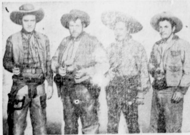
Out of the mighty West comes the fightest action hit in years. "Frontier Badman," with Robert Paige, Diana Barrymore, Leo Carrillo.