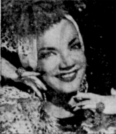
Carmen Miranda, the Brazilian Bombshell, will be on hand to sing her native songs and entertain with her inimitable brand of humor.