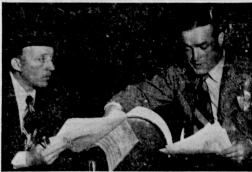
Bing Crosby and Bob Hope will trade quips during the two-hour Elgin-sponsored Christmas Day variety program for servicemen abroad and their families.