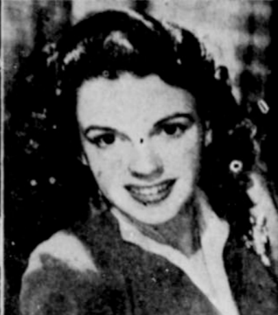
Judy Garland will add her lilt-ing notes to the musical portion of the show.