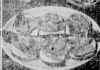
SECOND MEAL Sandwiches and Gravy