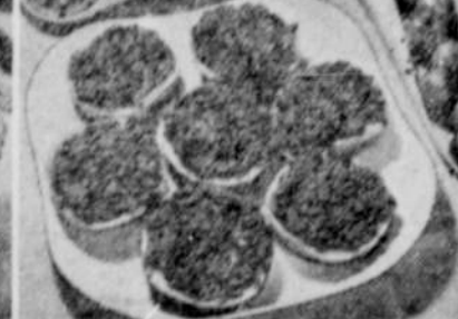
THIRD MEAL Barbecued Beef