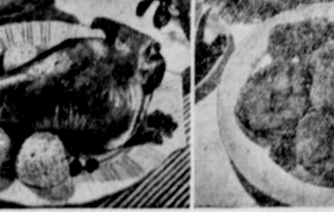
FIRST MEAL Roast Leg of Lamb