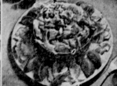
THIRD MEAL Reast Pork Salad