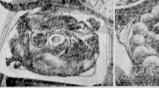
FIRST MEAL Roast and Noodles