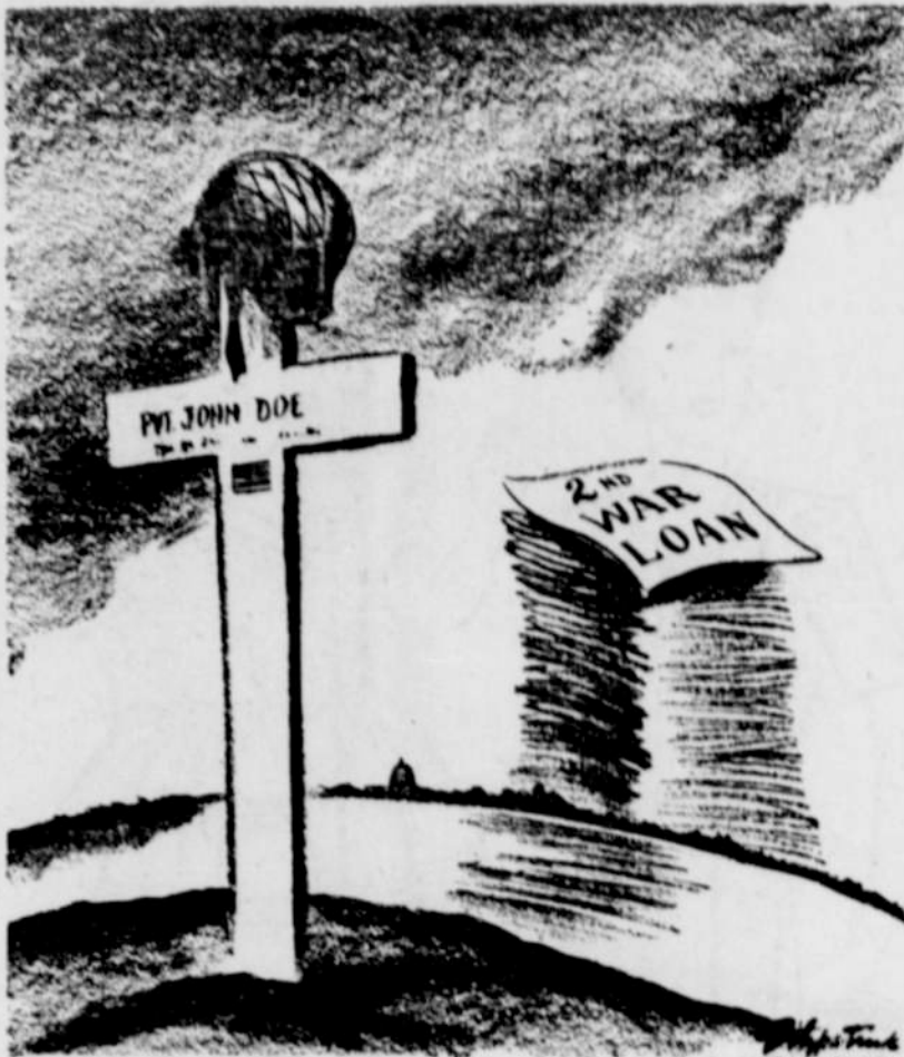
"They Give Their Lives—You Lend Your Money"