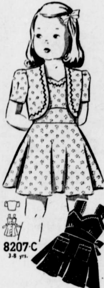
8207-C 3-8 yrs.