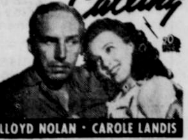
LLOYD NOLAN - CAROLE LANDIS