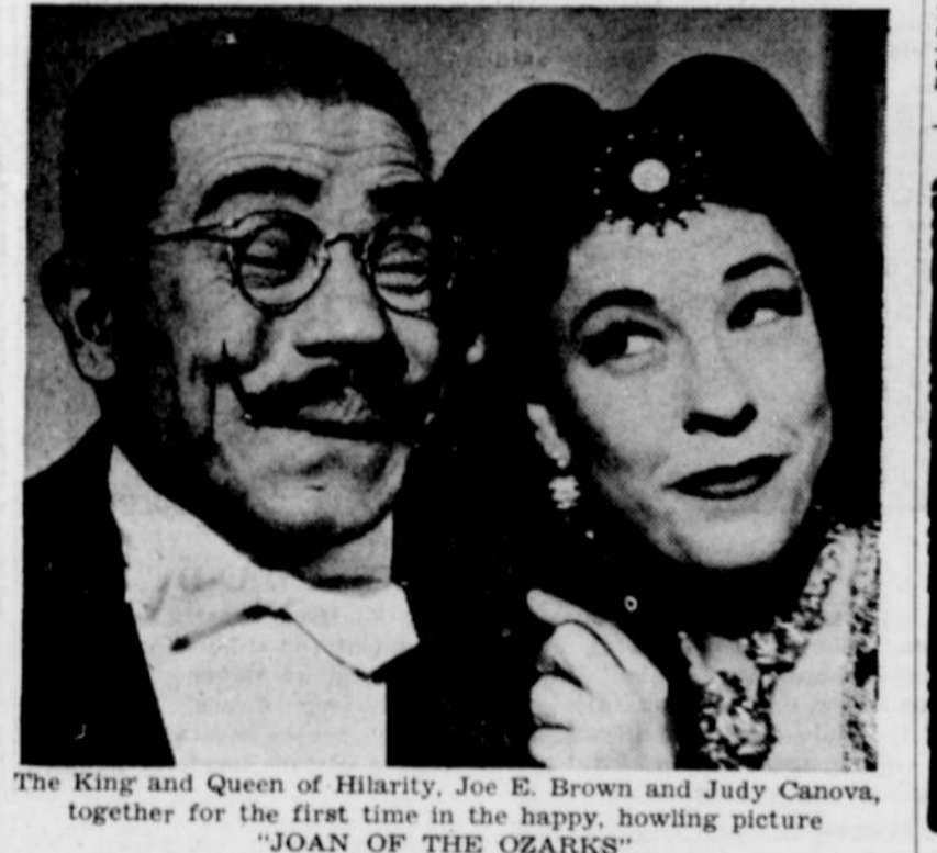
The King and Queen of Hilarity, Joe E. Brown and Judy Canova, together for the first time in the happy, howling picture "JOAN OF THE OZARKS"