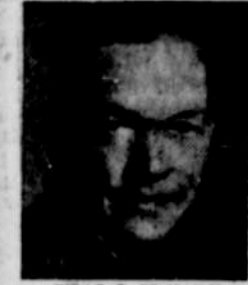
CHAS. L. McNARY Candidate for U. S. Senator. One of America's outstanding statesmen; minority leader of the Senate. He has the confidence of his associates; proved ability to work constructively and effectively for Oregon and the nation.