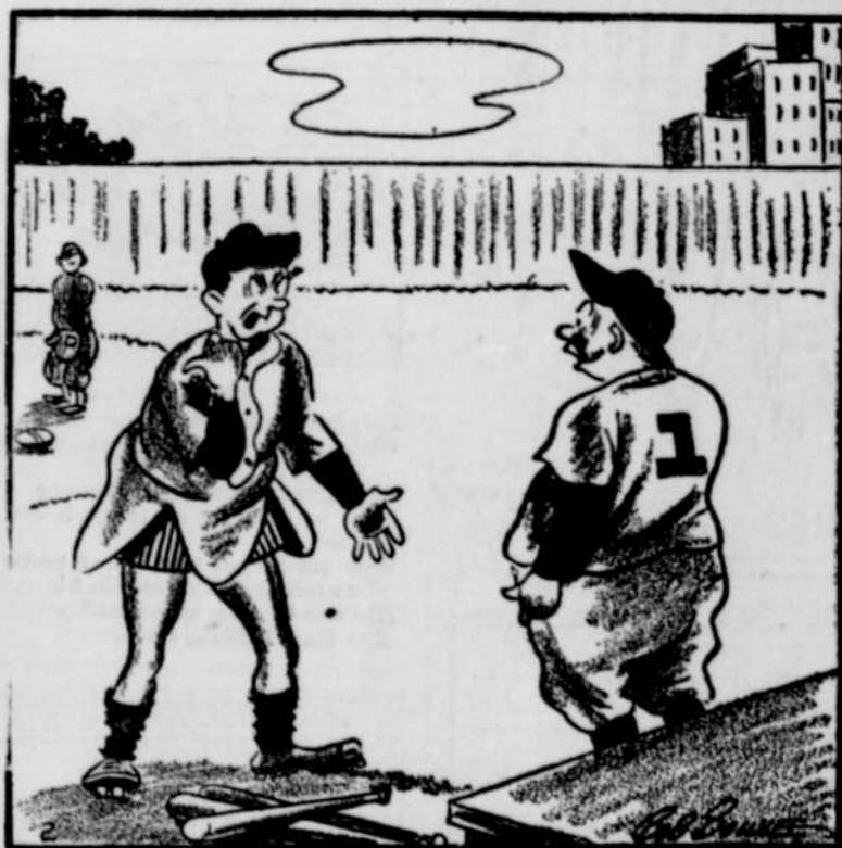
"Keep your eyes on their third baseman, boss. I got a suspicion he's light-fingered."