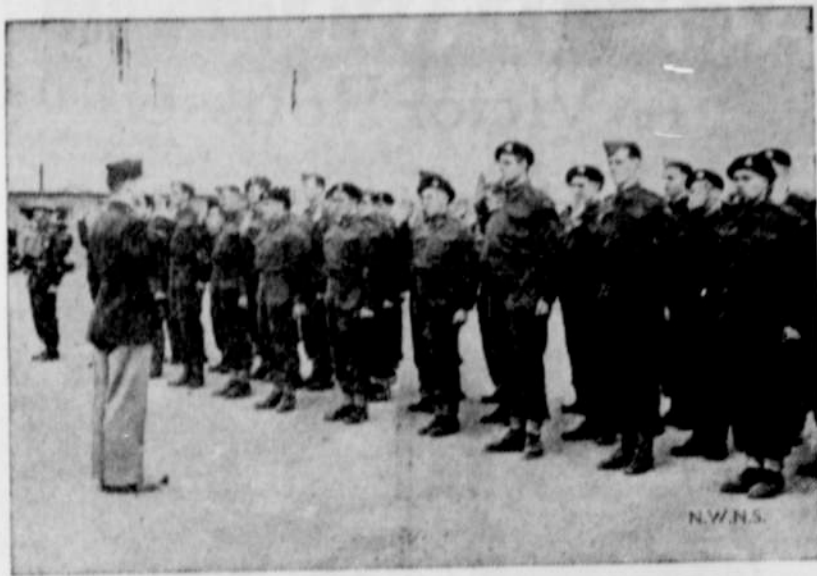
U. S. citizens who jumped the gun and got in the war, via the Canadian army, before Uncle Sam was attacked, are pictured just after their release from the Canadian army in England as they were sworn into the U. S. army. Britain is releasing any American who wishes to fight under his own flag. The above men still wear the Canadian uniform.