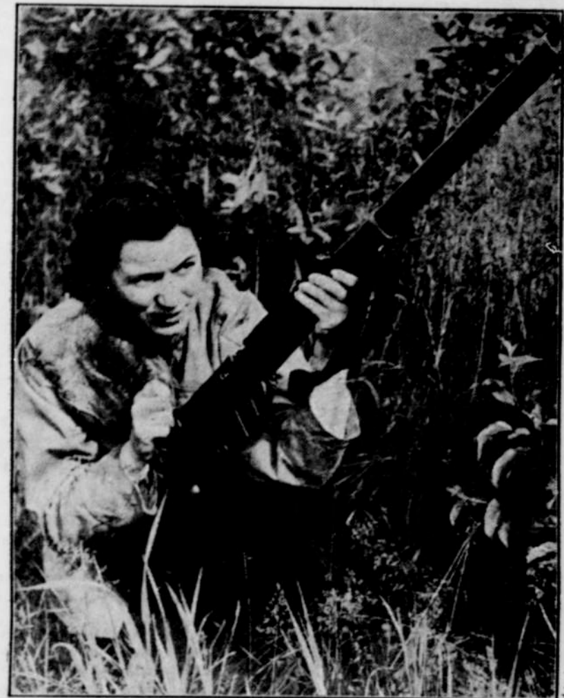
READY to help their menfolk defend their homes, the province, their families and themselves, women employees of many of British Columbia's larger companies, including Canadian National Railways, are organizing "Guerrilla Gals" shooting clubs on the Canadian west coast to train as potential guerrillas with the catchy motto "Gats for Gals."