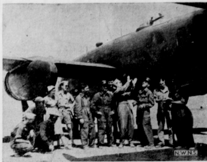
At a designated spot in the Middle East, U. S. medium bombers are being ferried from the U. S. and turned over to Russian fliers who take over from that point on. U. S. fliers act as instructors and aid the Russians in learning the controls of the American planes. Here a group of U. S. fliers and their Russian Allies are shown talking flight maneuvers.