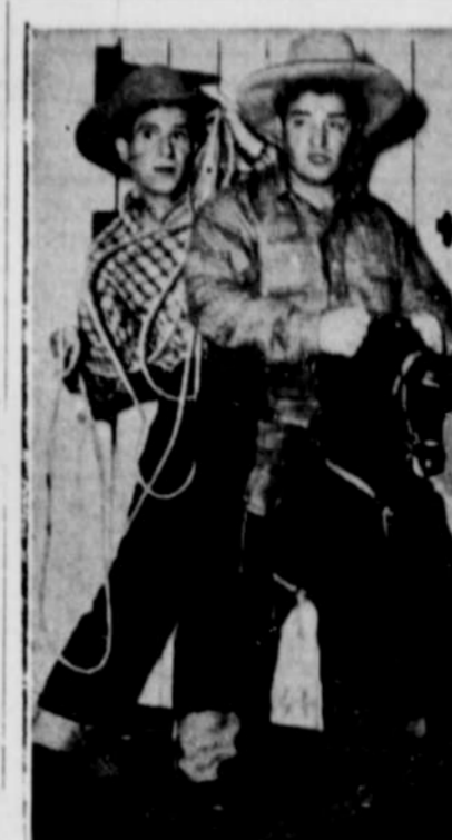
Bud Abbott (L) and Lou Costello in Universal's "Ride 'em Cowboy."

OF OREGON: You are hereby required to appear and answer the complaint filed against you in the above entitled suit within ten days from the date of service of this Summons upon you if served within this County; or if served within any other county of this State, then within twenty days from the date of the service of this summons upon you, and if served upon you in any State of the United States other than the State of Oregon, then within four (4) weeks after the date of such service; and if you fail to answer, for want thereof, the plaintiffs will apply to the court for the relief prayed for in their complaint.