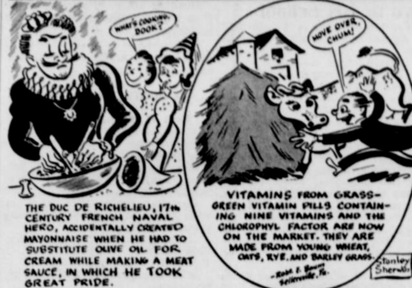
VITAMINS FROM GRASS-GREEN VITAMIN PILLS CONTAINING NINE VITAMINS AND THE CHLOROPHYLL FACTOR ARE NOW ON THE MARKET. THEY ARE MADE FROM YOUNG WHEAT, OATS, RYE, AND BARLEY GRASS.