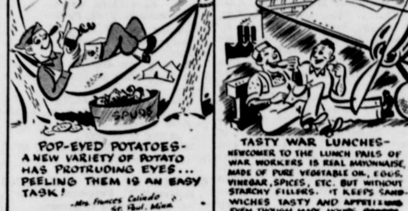
POP-EYED POTATOES—A NEW VARIETY OF POTATO HAS PROTRUDING EYES... PEELING THEM IS AN EASY TASK!

We will pay $5.00 in War Savings Stamps for each strange food fact submitted to us and used. Address, A WORLD OF FOOD, 239 West 39 Street, New York, N. Y.