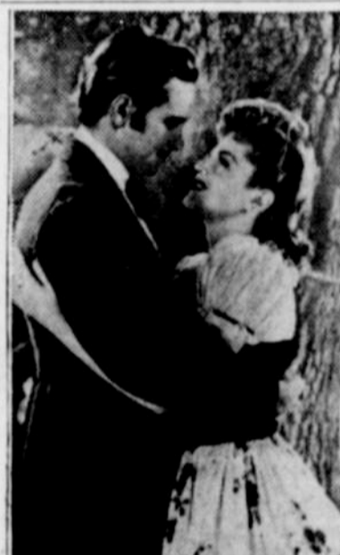
'Texas' Romance is shown above with William Holden and Claire Trevor in a scene from Columbia's "Texas," now at the Lithia Theatre.

When politicians running for office gave you a cigar for your vote?