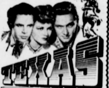
with WILLIAM HOLDEN - CLAIRE TREVOR - GLENN FORD George Bancroft - Edgar Buchanan A COLUMBIA PICTURE

Saga of Smashing Fists and Clashing Hearts!