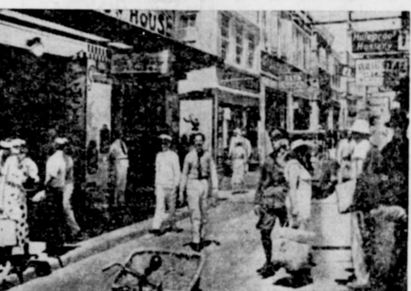
A street scene in the business section of Willenstad, capital of Curacao, the Dutch island off the northern coast of Venezuela, which has been occupied by American troops. The troops were sent to reinforce the Dutch units which have been guarding the highly important oil refinery, centers on the island.