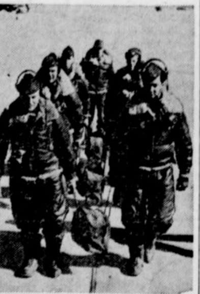
Aviation cadets at only bombardier training air corps advanced flying school in the country, in Albuquerque, N. M., carry secret bomb sights in zipper bag before take off.