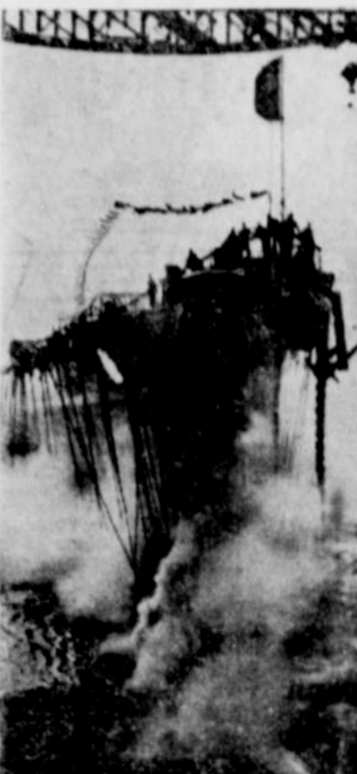
This soundphoto pictures the newest addition to Uncle Sam's swiftly growing navy, the U. S. S. Montpelier—a cruiser—which was launched at the New York Ship Building company's yards in Camden, N. J., and will soon be searching the high seas.