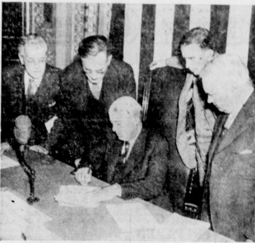
Speaker of the house, Sam Rayburn, is shown signing neutrality act revision measure shortly after it had passed the house with the amendment allowing armed U. S. merchant ships to enter war zones.