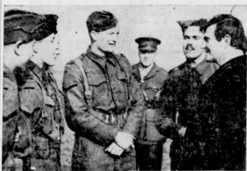
On a recent visit to the camp of the Sixtieth Rifles (King's royal rifles) of the British army, John G. Winant, American ambassador to Great Britain, met five Americans who had enlisted in the regiment.