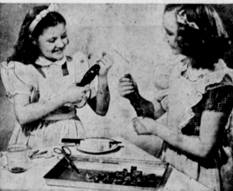
HERE'S TO BUTTERY FINGERS AND A TAFFY PULL (See Recipes Below)