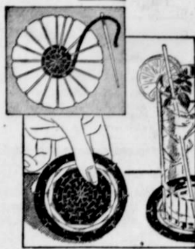
'Loom' Is Circle of Cardboard.

A SET of these smart red-and-white coasters is so delightfully easy to weave!