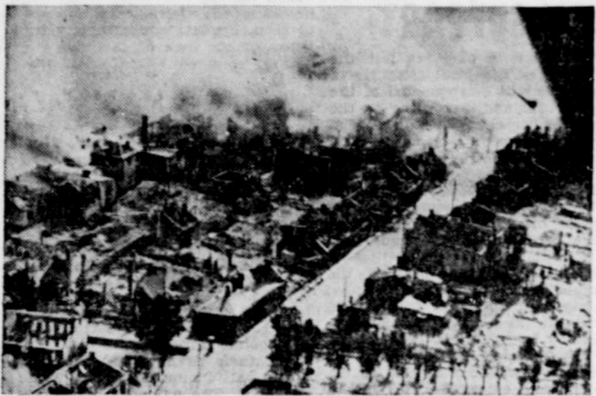
The German caption merely calls this spectacular picture of a city in flames "the burning of Dunaburg." Dunaburg is the Russian city of Dvinsk in White Russia. It was once a great artillery center for the Russian army. "Nothing but the complete annihilation of the Soviet forces will end the Russo-German war" is the conclusion reached in military circles in Berlin.