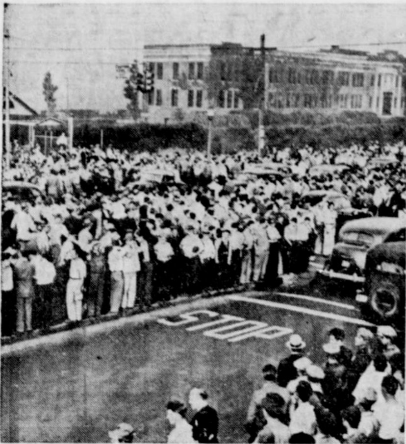
Part of the 14,000 shipyard workers of the Federal shipbuilding plant are shown here standing idle outside the plant at Kearney, N. J., after having been called out by the C.I.O. In the meantime $373,000,000 in defense shipbuilding work came to a standstill. Two cruisers, six destroyers, three tankers and two cargo boats are on the ways at this plant.