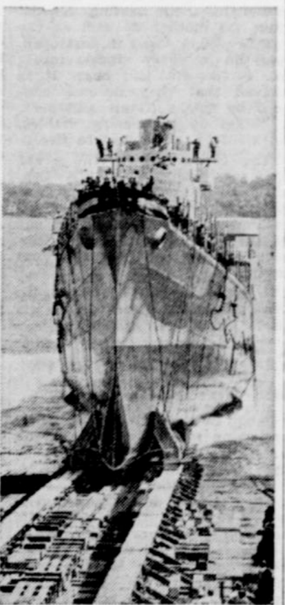
Streamlined San Diego, one of the speediest cruisers ever built for the navy, launched at the Bethlehem Steel company's Fore river plant, Quincy, Mass. Bearing some resemblance to a destroyer, the new light cruiser has no raised forecastle.