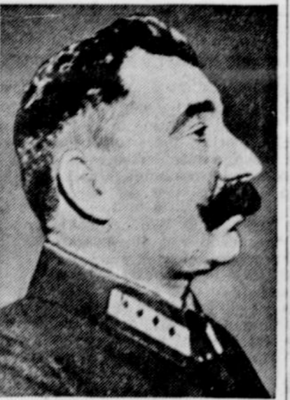
Marshal Semeon Budenny, commander of Russian armies operating on the southwestern front, who led the Red counter-attack against the assaults of the German army