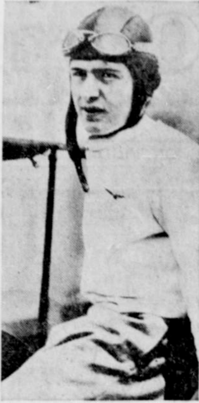
One of the most recent photos of Bruno Mussolini, 23-year-old son of Premier Benito Mussolini, who was killed in an air accident at Pisa, Italy. An officer in the Italian air force, young Mussolini flew in the Ethiopian campaign, and with the Italian "volunteers" in the Spanish civil war. No details of the air accident were given.