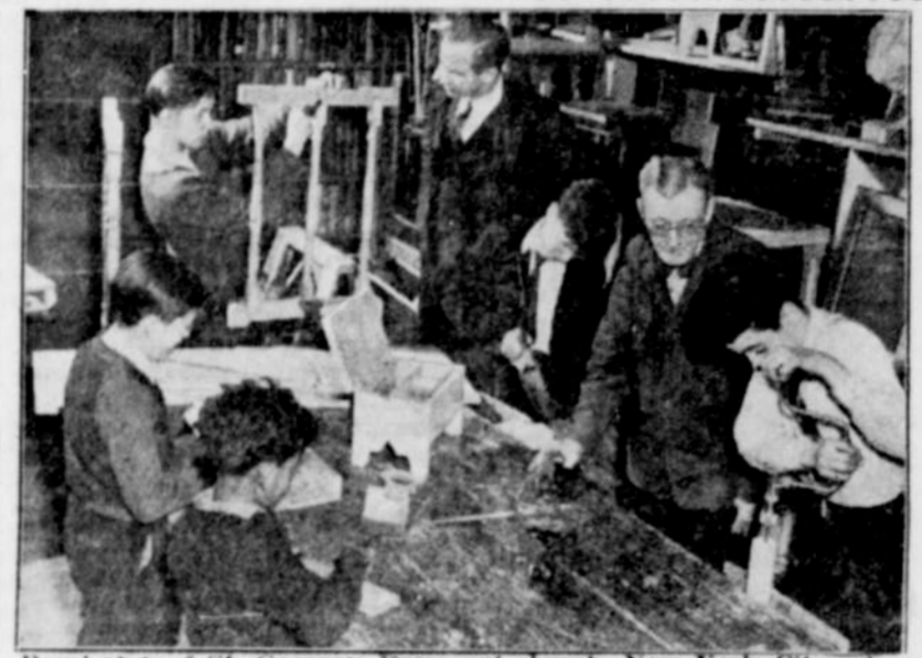
Boys' club of St. George's Episcopal church, New York City, gives to youth of all faiths, fun, hobbies, manual skills, as part of practical social service program.