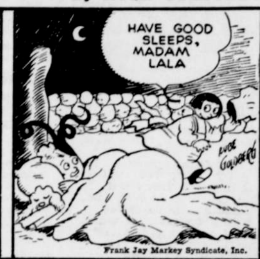
S'MATTER POP-This Would Call for Whiskers on Every Second Soldier