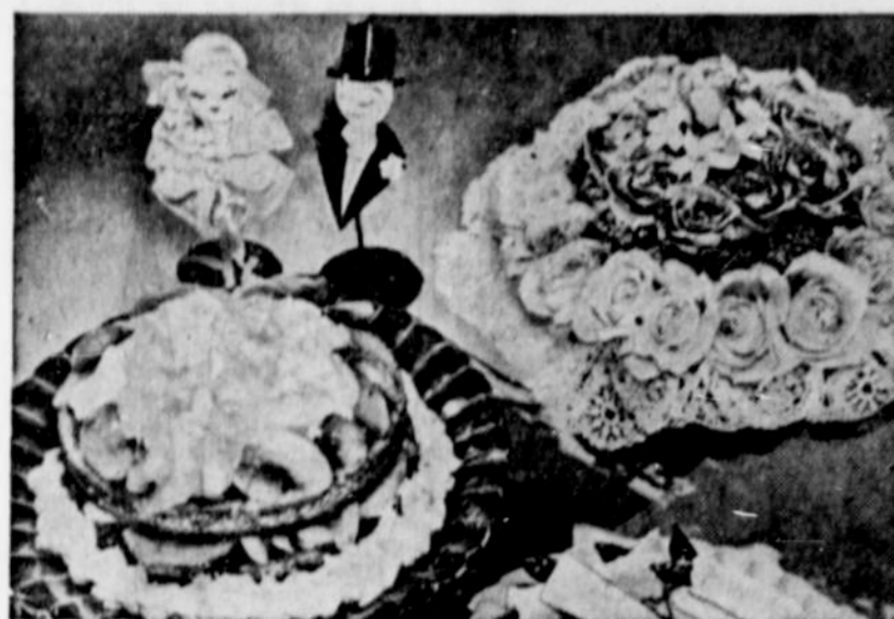
... AND SO THEY ARE MARRIED (See Recipes Below.)