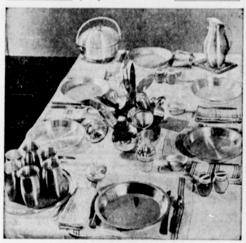
EVERYTHING FOR HER NEW KITCHEN (See Recipes Below)