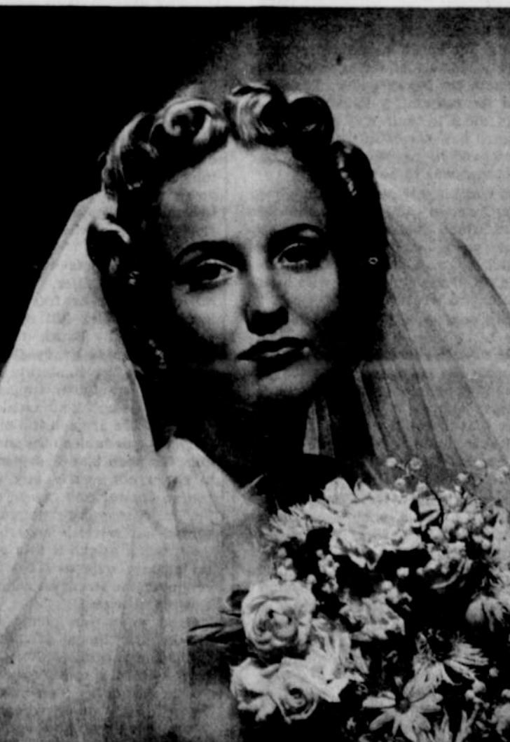
See page four for information of valuable Bride's Book—free.