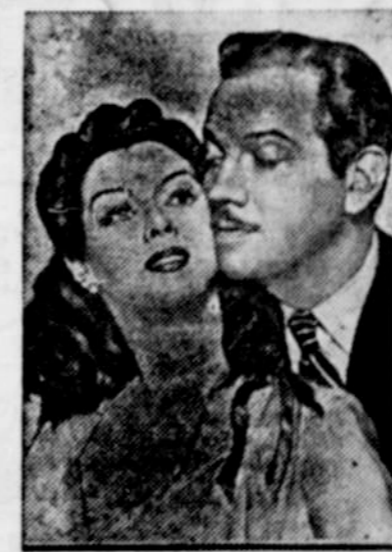
Co-starred at the Lithia theater, Rosalind Russell and Melvin Douglas are shown above in a romantic scene from Columbia's "This Thing Called Love." For the most part their "romance" is a battle royal!