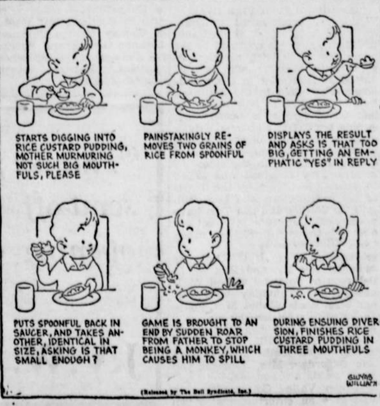
(Released by The Bell Syndicate, Inc.)