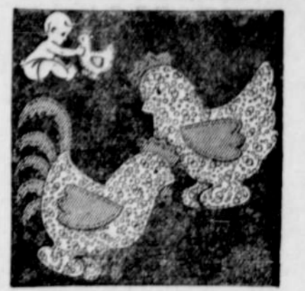
Pattern No. Z9634.

ALL padded and preened are Hattie, the hen, and her proud rooster hubby. They've plain-colored wings, tail feathers and combs—and not one ruffled feather on their 13-inch print-material bodies.