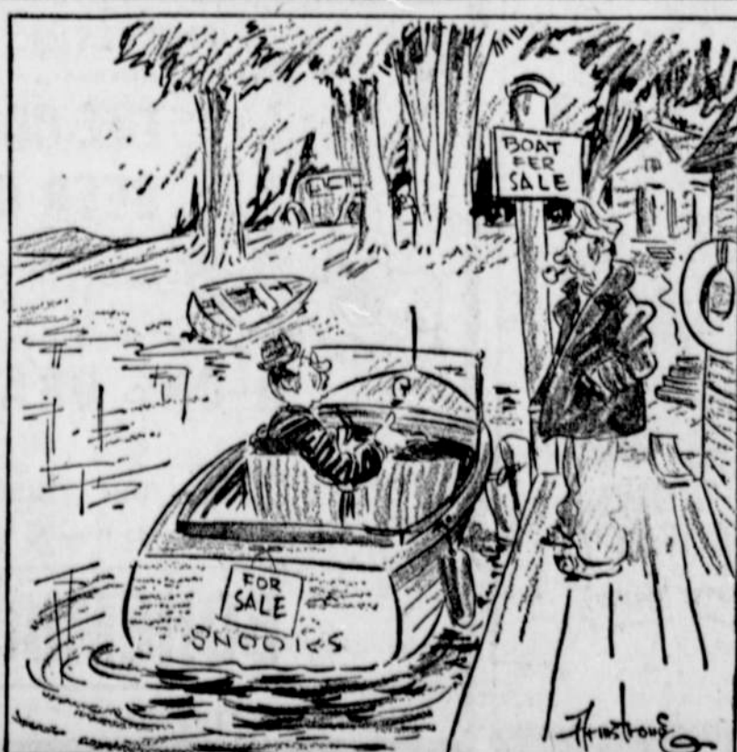
"Sure runs fine on the level. How is it on hills?"