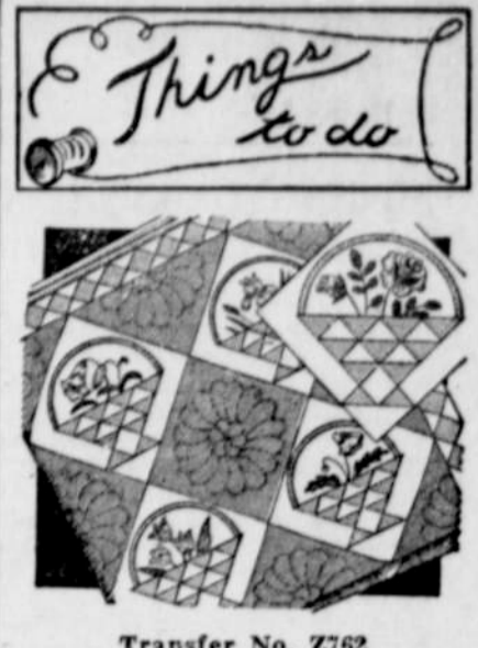
Transfer No. Z762

THE Flower Basket quilt is one of the most beautiful and versatile designs you could imagine. Parts of the flowers may be appliqued and the rest done in outline, or if you desire, the flowers may be done entirely in embroidery.