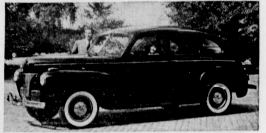
1941 Ford Super DeLuxe Fordor sedan. Like the rest of the new Ford line, it is larger, easier riding, and more beautiful outside and in.