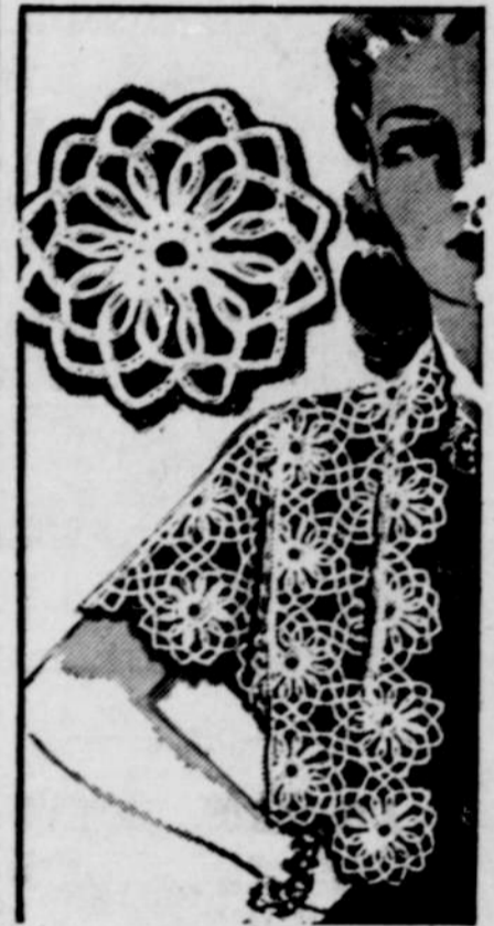
Pattern No. 2582

BE IN style—add this crocheted shawl to your wardrobe. It's in Shetland Floss—just one easy medallion repeated and joined. Pattern 2582 contains directions for making shawl; illustrations of it and stitches; materials required. Send order to: