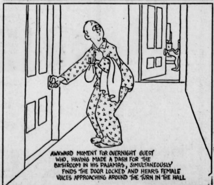
AWKWARD MOMENT FOR OVERNIGHT GUEST WHO, HAVING MADE A DASH FOR THE BATHROOM IN HIS PAJAMAS, SIMULTANEOUSLY FINDS THE DOOR LOCKED AND HEARS FEMALE VOICES APPROACHING AROUND THE TURN IN THE HALL.