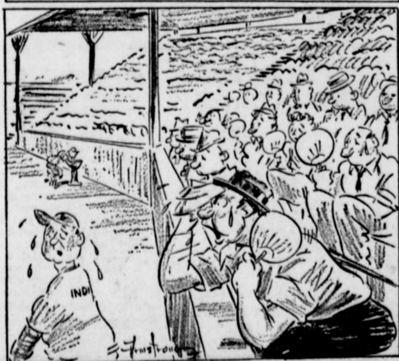
"C'mon - get hot out there."