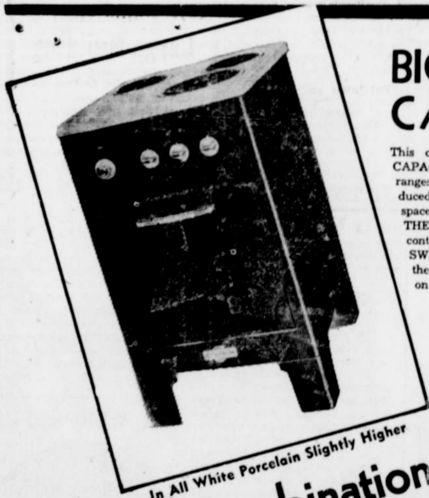
In All White Porcelain Slightly Higher

Special Combination Offer on Range & Heater