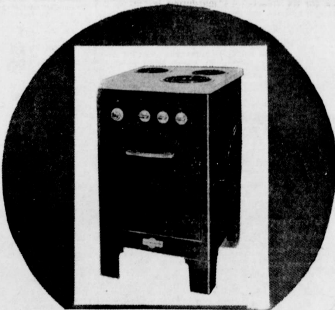
Same Model Range Available in All White Porcelain at only a Slight Increase in Cost