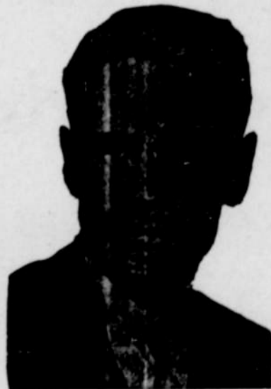
REPUBLICAN CANDIDATE FOR NOMINATION AS