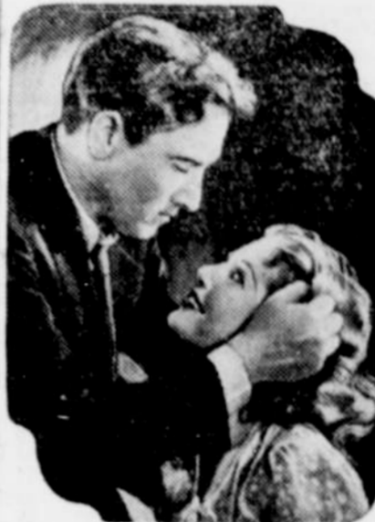
ABOVE are Loretta Young and Spencer Tracy who appear together in "Man's Castle," coming Sunday to the Lithia theater for a three-day run.