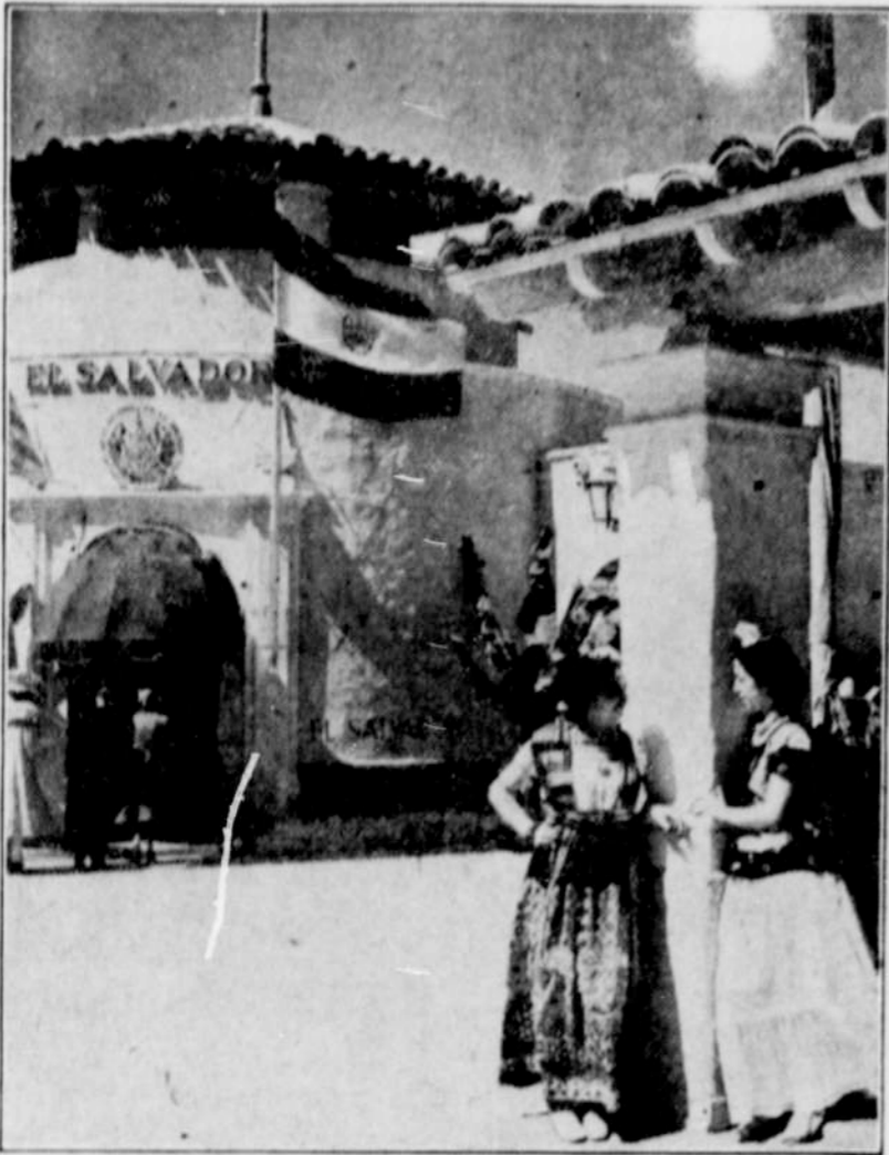
In the Latin-American Court on Treasure Island nations to the south of United States have provided California World's Fair visitors with all the color and romance of their respective countries. At the right are lovely señoritas of the Mexican Pavilion. At the left is the El Salvador Pavilion, featuring one of the best marimba bands in the world.