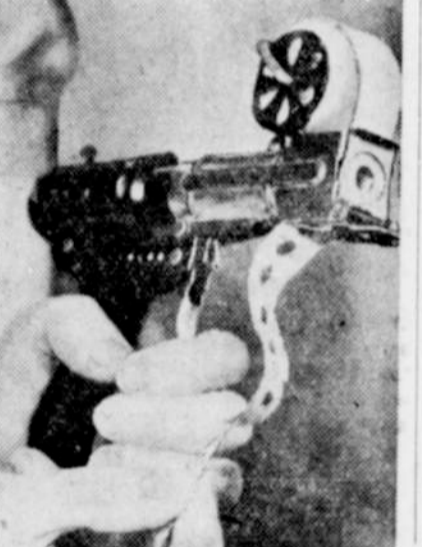
A paper roll is fed through this "gun." A plunger worked by compression, crashes against the paper, with the same noise effect as the smashing of an air-filled paper bag.