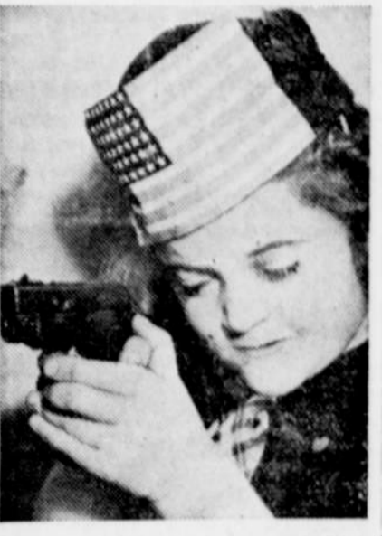
The pained expression on this young lady's face is not due to fright. The sparkler gun which she holds is guaranteed safe. It shoots out sparks, but they will not cause fire.

Noise—lots of loud, ear-shattering noise—is the principal ingredient of every child's Fourth of July celebration. But the danger has been removed. No longer need you worry when Junior and Sis decide to rouse the neighborhood. New mechanical noisemakers have been designed to replace exploding firecrackers and miniature bombs.