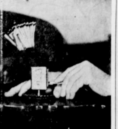
Whenever a harassed guest strikes a match, all the remaining matches in this trick box jump out. The polite guest, often unaware, will pick them up again. The hardened practical joker appreciates this.