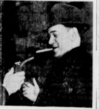
No matter how steady your nerves, it is disconcerting to have a repulsive looking snake leap at you when a friend offers you a light from his new mechanical gadget.