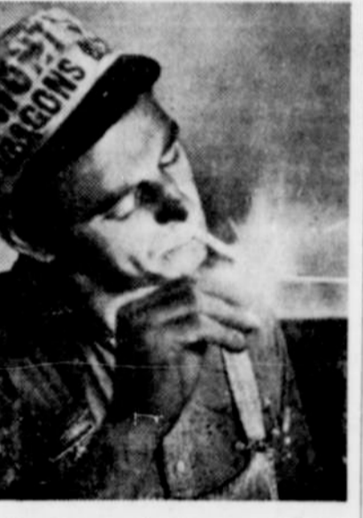
Smokers, natural prey of tricksters, have good cause to be wary. Here an exploding match, handed the unhappy smoker, adds little to his enjoyment.