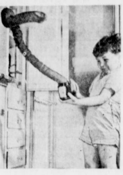
Thought to have originated in France in connection with the calendar reformation of 1564, All Fools' day spread rapidly and today is observed in many lands, particularly our own. Even the children aren't safe. This lad, finding the jam jar, is unpleasantly surprised when a five-foot "snake" lunges at him.