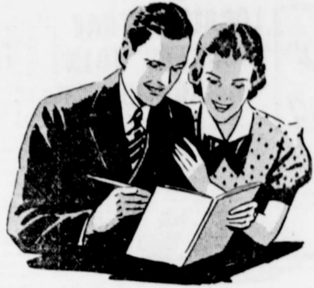
Figure Convenience, Too!

Electricity costs LESS in Ashland, but along with your monthly bills there is another factor to consider, too—the saving in time, effort, muss and inconvenience which electrical appliances bring to the home and office. Figure in your time, your effort and your saved steps when adding up your "light bill." You'll find the electrical home pays in many ways!