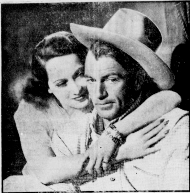
GARY COOPER and Merle Oberon, shown above as they will appear in "The Cowboy and the Lady" coming to the Varsity theater Sunday, Monday and Tuesday, Jan. 1, 2, and 3.