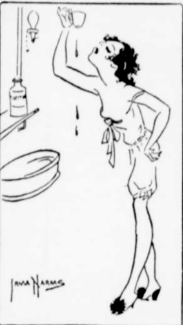
"Now-a-days girls don't hesitate to mention things that take your breath away."