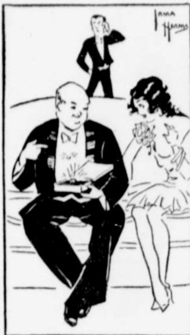
"When money talks, it doesn't mean anything."