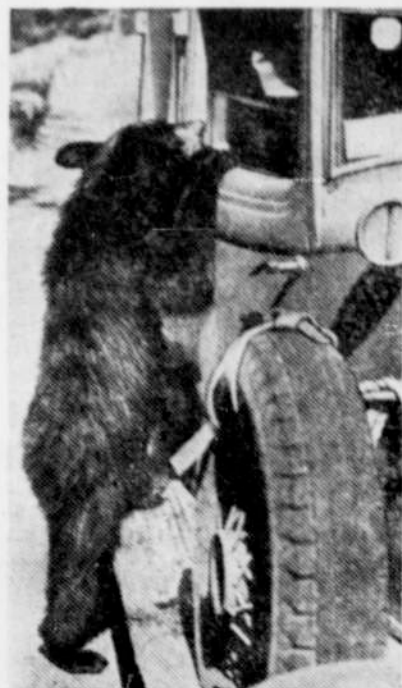
Black bears beg like this on going-to-the-Sun highway in Glacier National park. Many "goodies" are handed bruisers through car windows by tourists driving through the park.