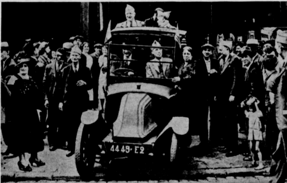
An American Legion post of Portland, Ore., recently bought in Paris, France, a taxicab 25 years old and had it shipped to Oregon. It is one of the famous fleet of cabs that carried French troops from Paris to the first battle of the Marne. The old vehicle is here seen starting its long journey.