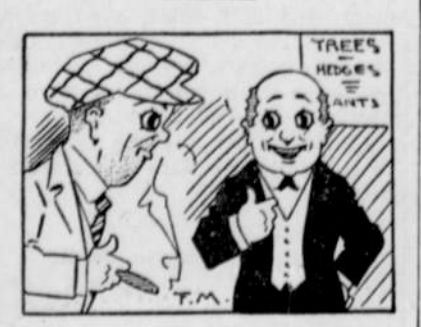
Ex-Pugilist-I want you to get my hedges going. What shall they be? Nurseryman-Boxwood, of course. reeled."